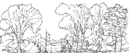
Unit monthly outings