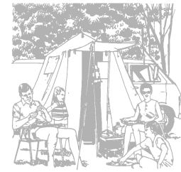
Cub family camping