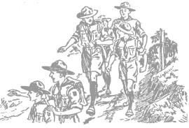
Groups in the woods