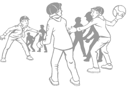
Loud wide area games